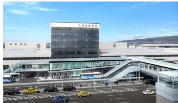
Exterior of terminal building