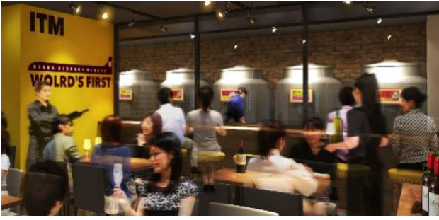
Osaka Airport Winery First in World, First in Airport!

For more details, please kindly find the following site.