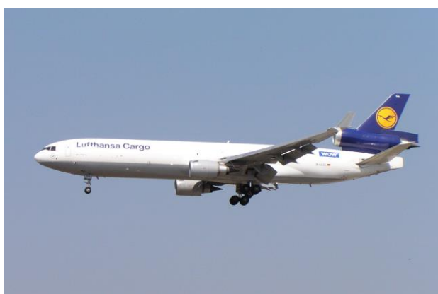
Pictured by Lufthansa Cargo

https://www.facebook.com/KansaiInternationalAirport/videos/vb.216793798343922/1661830787173542/?type=2&theater