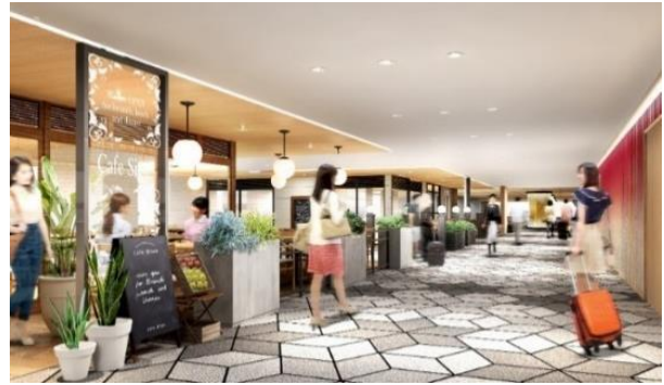
Level 2 central restaurant zone

Furthermore, arrival gates, previously separated into two north and south locations on Level 1, will be consolidated into the central area on Level 2, enabling seamless transfer to ground transportation such as a monorail or bus.