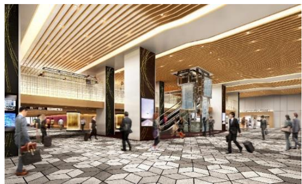
Level 2 central arrival area